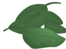
Dark, leafy greens